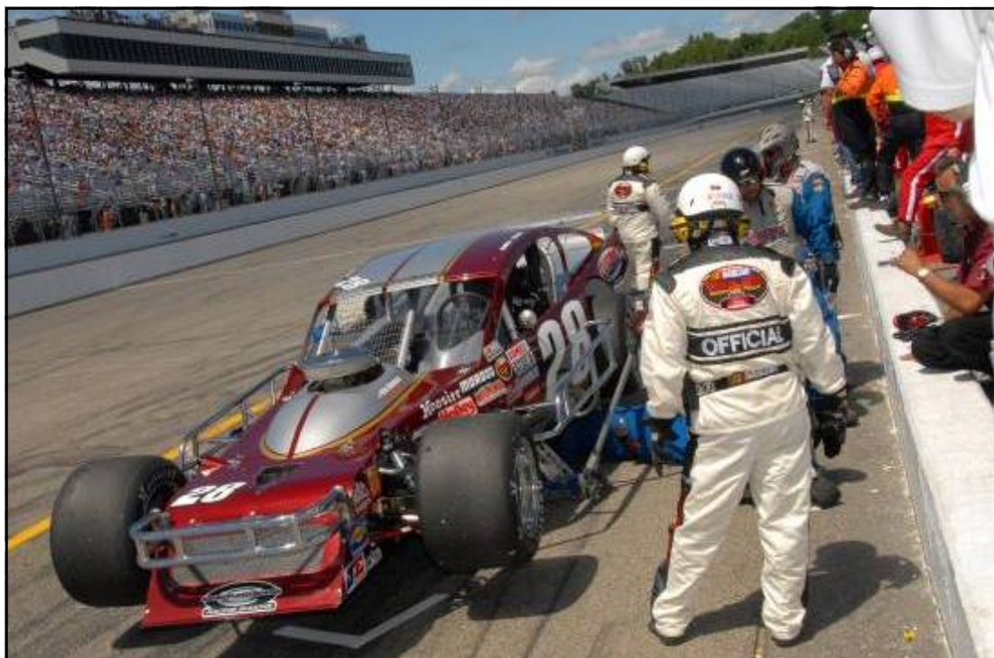
All eyes will be on the NASCAR Whelen Modified Tour Saturday at Loudon. (Photo: Howie Hodge/NASCAR).