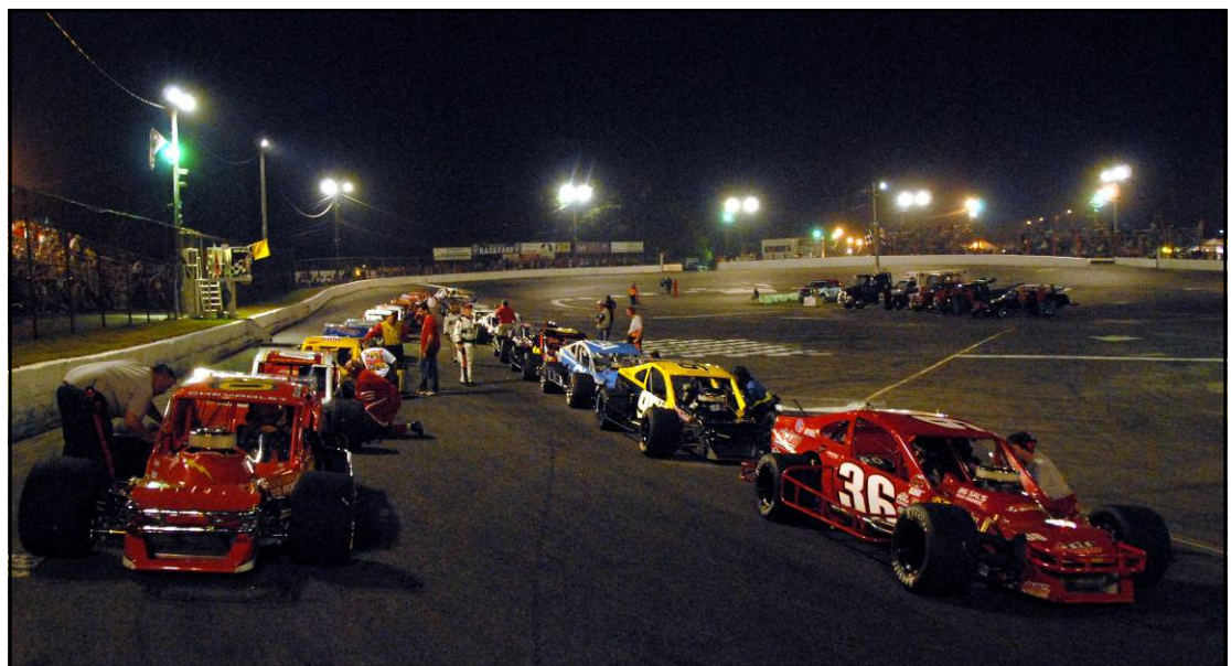
Riverhead's quarter-mile circuit has played host to 46 NASCAR Whelen Modified Tour races since 1985.