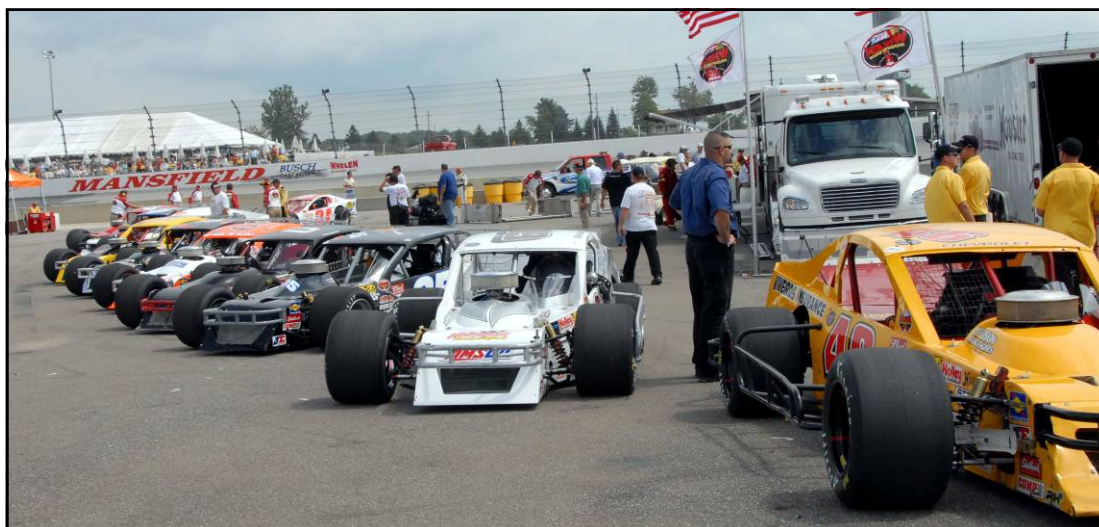
Mansfield Motorsports Park will be the site of the Whelen 150 on Saturday.