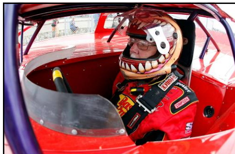
Red Farmer still continues to race in his mid-70s.

Weatherly, who gained fame as a two-time NASCAR Sprint Cup Series champion, earned his first NASCAR title in the Modified division in 1953.