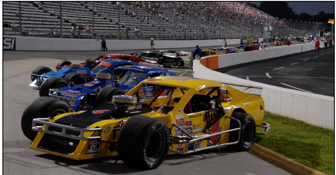
Saturday will be the 32nd all-time NASCAR Whelen Modified Tour race at Martinsville.