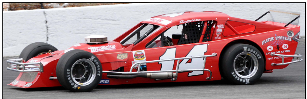
Reggie Ruggiero is tied for the NWMT wins lead at Martinsville with four. (Photo: Howie Hodge/NASCAR).

We build Modified race cars for the Tour, for SK teams, for any type of open-wheeled Modified racing. We also do Late Model cars and Pro Stock cars. We do a lot of motorcycles, custom hot rods, antique muscle cars, so we work in all phases of automotive specialty work.