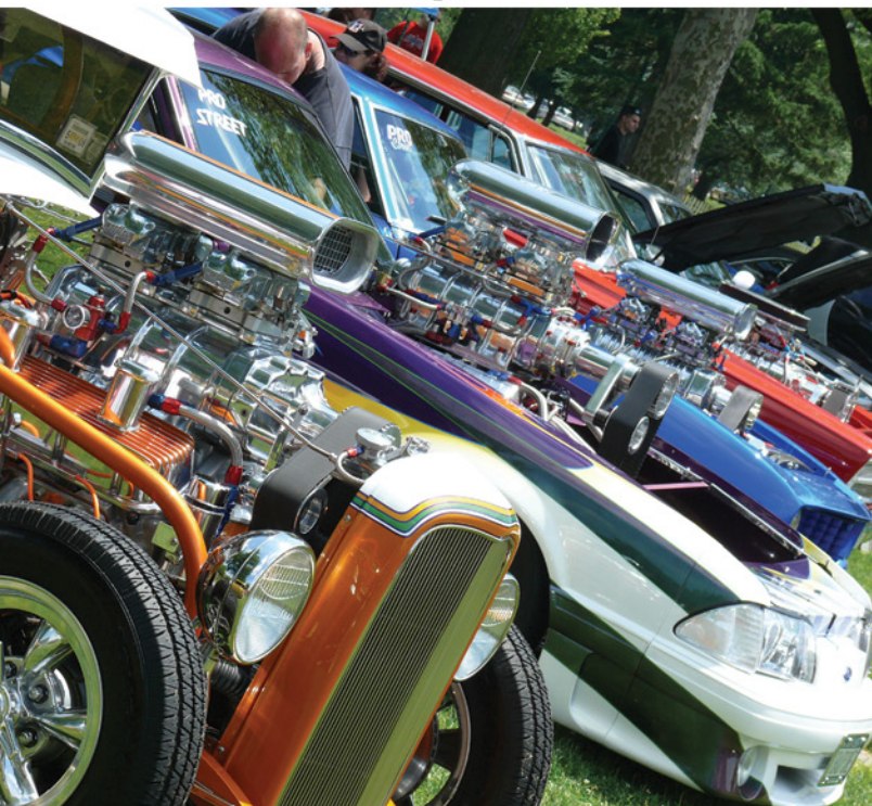
PHOTO FROM 2008 EISENHOWER PARK SHOW

Hot Rods, Rat Rods, Pro-Street, Imports, Exotics, Race Cars, much much more!