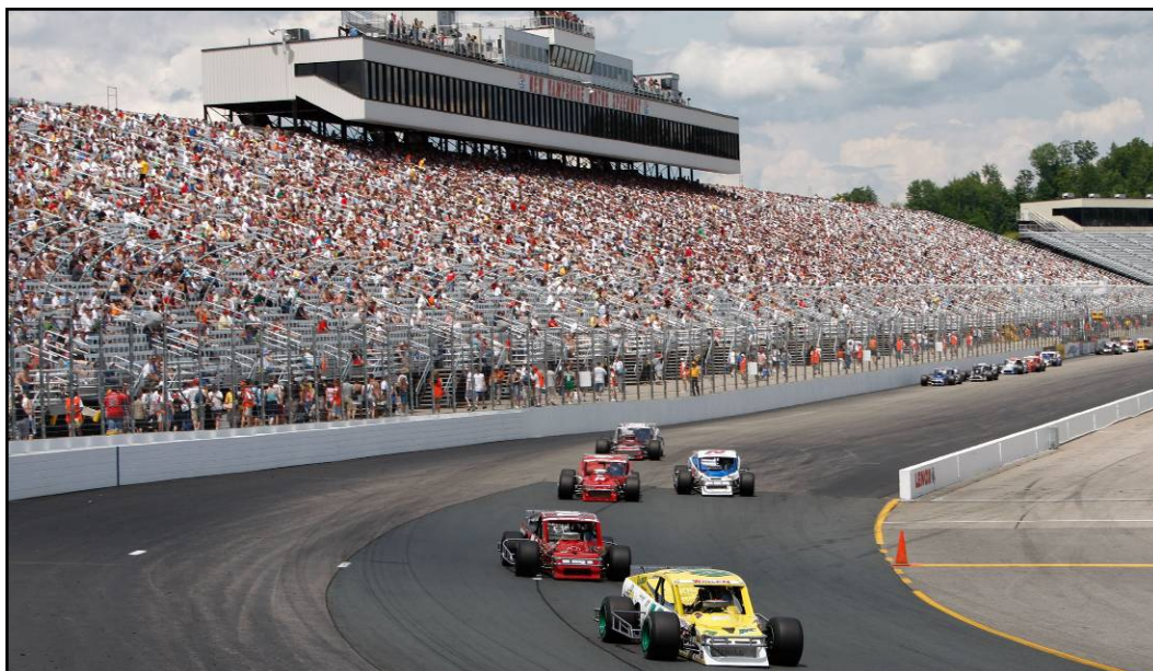
The New Hampshire 100 will mark the 50th running of the NWMT at the "Magic Mile."