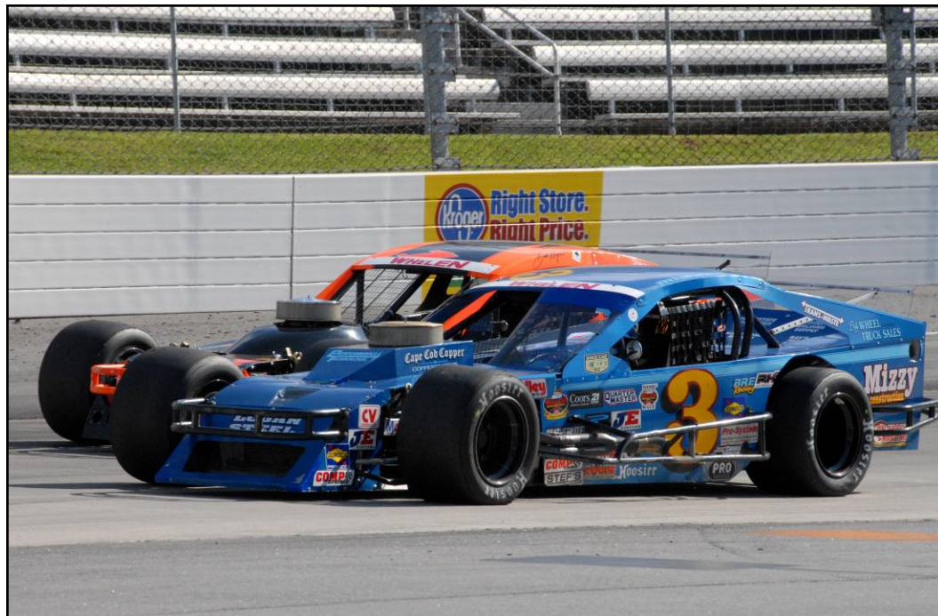
Ryan Preece (3) and Burt Myers (1) once again figure to contend for the Martinsville checkered flag.