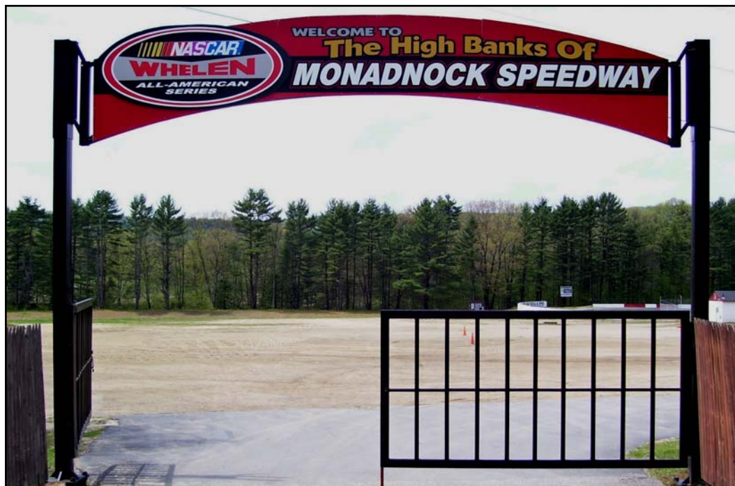
Monadnock's high banks will play host to the Whelen Modified Tour for the first time since 1990.