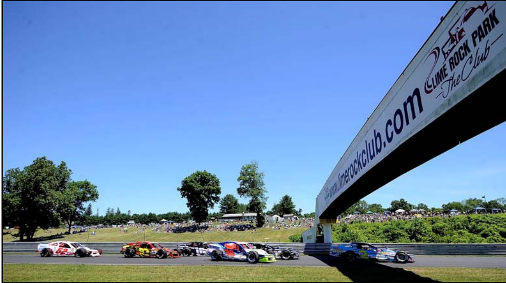
The inaugural Whelen Modified Tour race at Lime Rock took place on July 3.