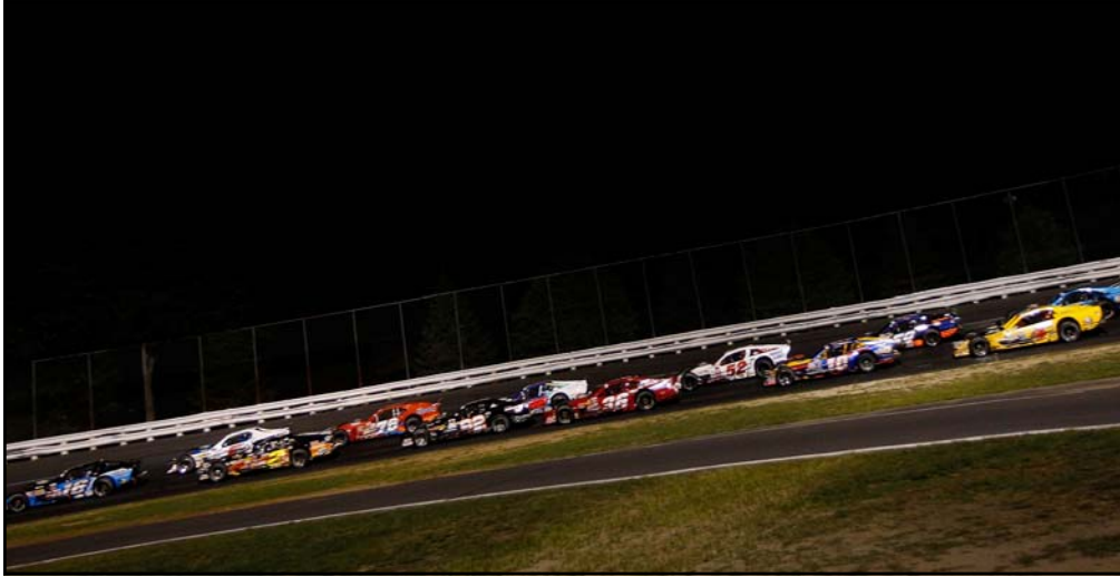
The second date of a four-race, 19-day stretch in the 2010 schedule took place on Friday at Stafford Motor Speedway with the Town Fair Tire 150.